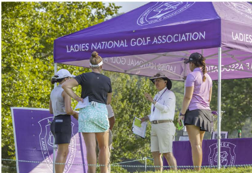
Supporting Women's Athletics as a Pathway for Empowerment