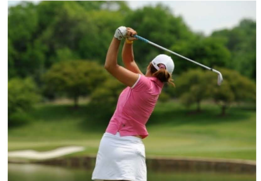
Connecting with Audiences Who Care About Golf