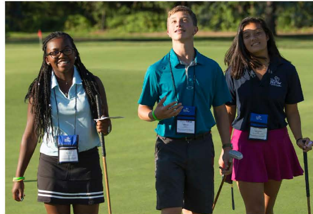
Growth and Support for Local Golf and Youth Programming